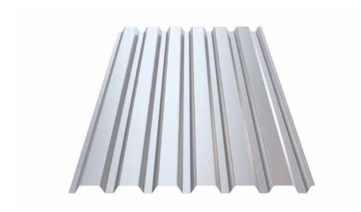
Figure 1 RoofDek D35 profile

RoofDek D35 is shown in Figure 1 and is an ideal choice of roof deck profile when securing to purlins, typically spanning 1.5m to 2.5m. The D35 product has a 150mm profile pitch, which fits perfectly with most single ply membrane manufacturers guidelines for mechanical fixing of their membrane to a deck which require fasteners at 150mm centres. Furthermore, the D35 profile has a 75mm crown, which provides a 50% surface area and is more than sufficient for most adhesive systems when bonding to the deck. For those looking for additional architectural features, the D35 profile can be supplied factory crimp curved, right down to a 400mm radius.