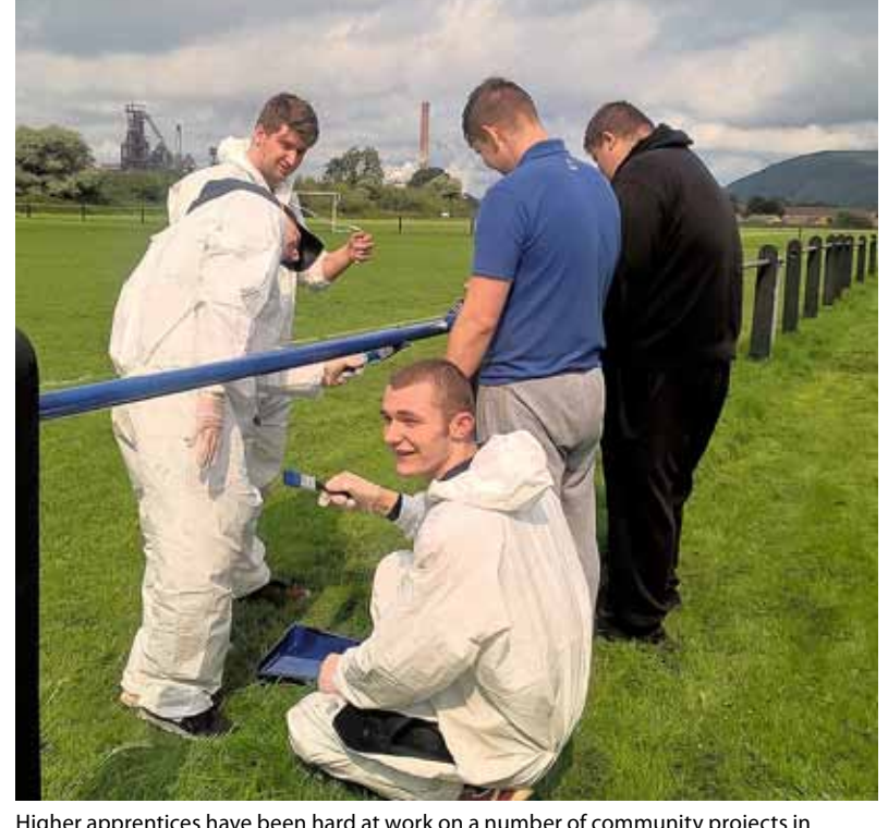
Higher apprentices have been hard at work on a number of community projects in Taibach and Margam

continued use of the building for Port Talbot's Foodbank. Keep an eve on Tata Steel social