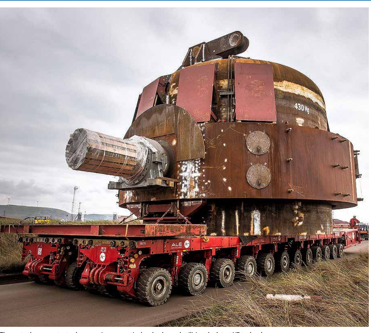
The route the converter took across site was meticulously planned utilising the latest VR technology

of materials has been used to rebuild roads. We also scanned the route and used virtual-reality (VR) technology to check the converter would fit under certain infrastructure, such as under the conveyors near the Sinter Plant.