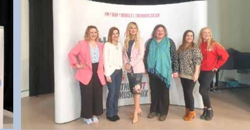
Politicians, media industry experts and engineers were among the women to give insights into their careers

for the young girls across the school roadshows, but the online platform has also ensured the campaign has been open to women of all ages and at all stages in life. It has certainly helped to change perception of women in male dominated industries like ours. Our female engineers have helped break some of the stigmas associated with working in heavy industry, which has been great to witness at the roadshows." Check out the special 'Women of Steel' section of the Wave website www.thewave.co.uk to read more Women of Steel profiles.